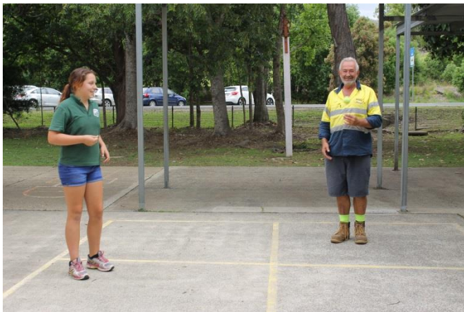
Gallery - Grandparents Day