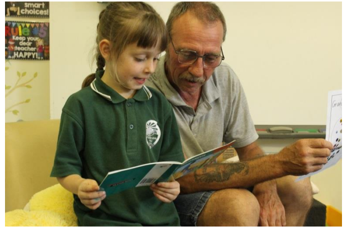
Gallery – Grandparents Day