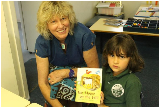
Gallery – Grandparents Day