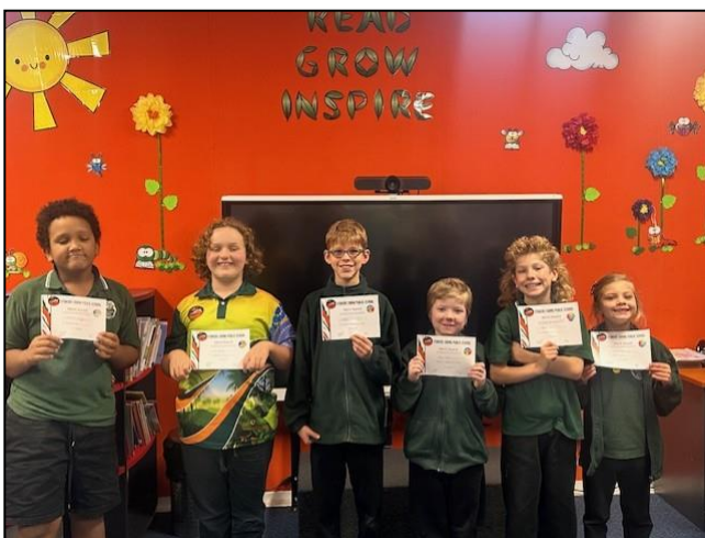
Year 3-6 Awards