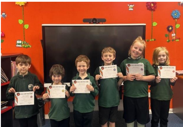
Year K-2 Award